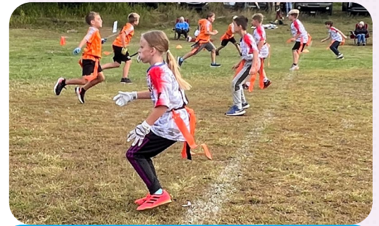
Flag Football League in action.