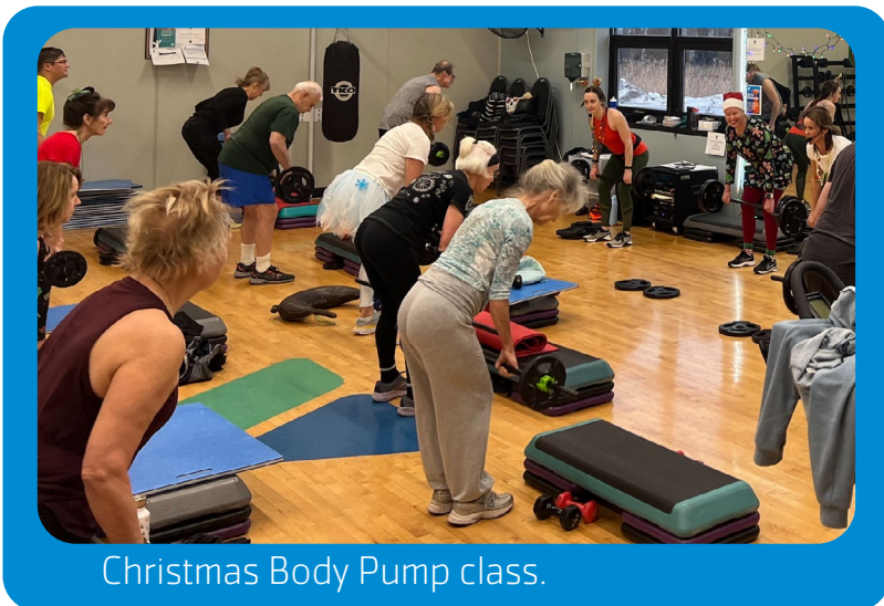
Christmas Body Pump class.