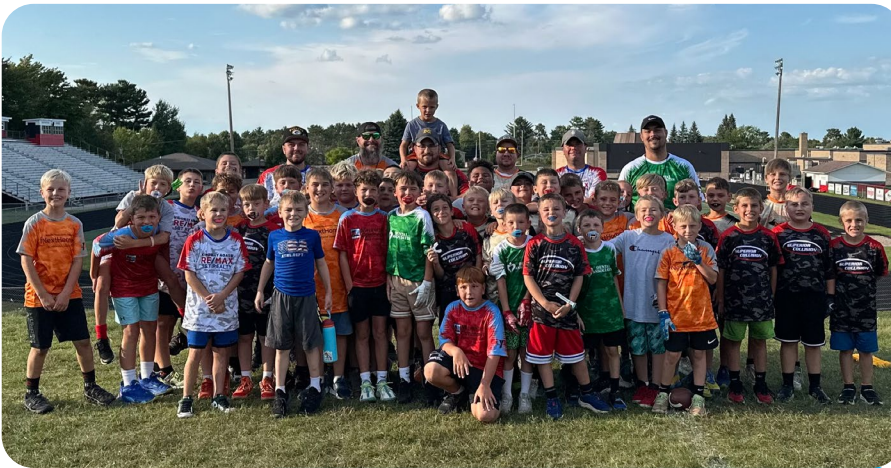
Flag Football League teams and coaches.