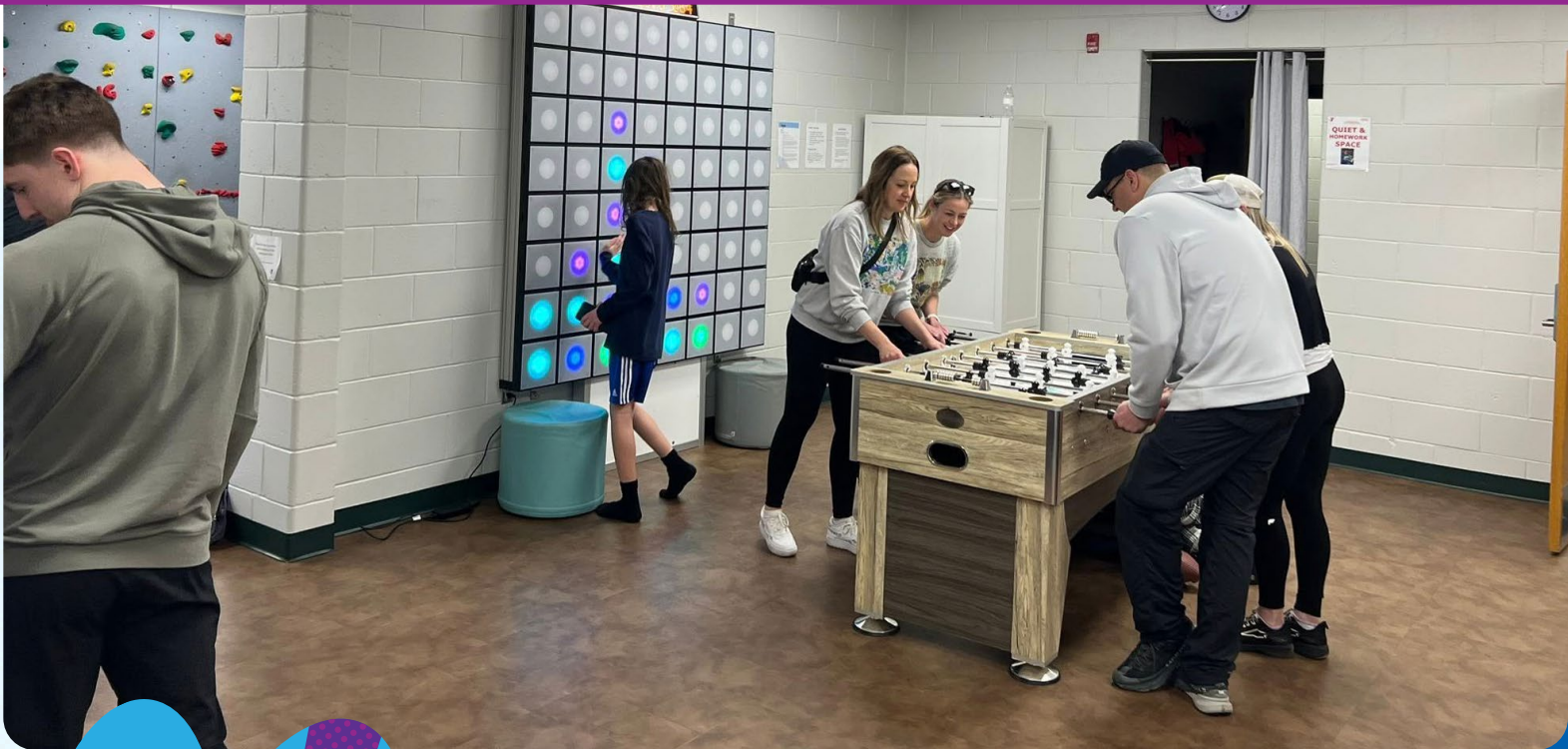
Families playing in the Youth Center at Healthy Kids Day.