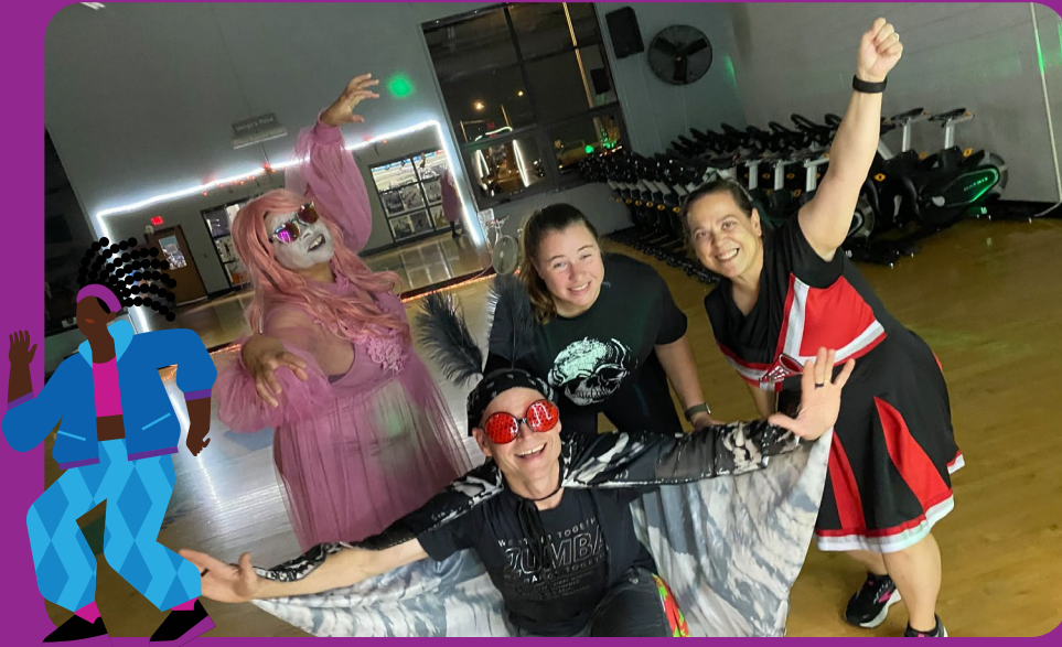
Zumba class on Halloween.

Two of the most common reasons participants value these programs are the accountability and the professionally designed programs these services provide.