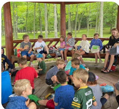
Day Camp lunch at Presque Isle.