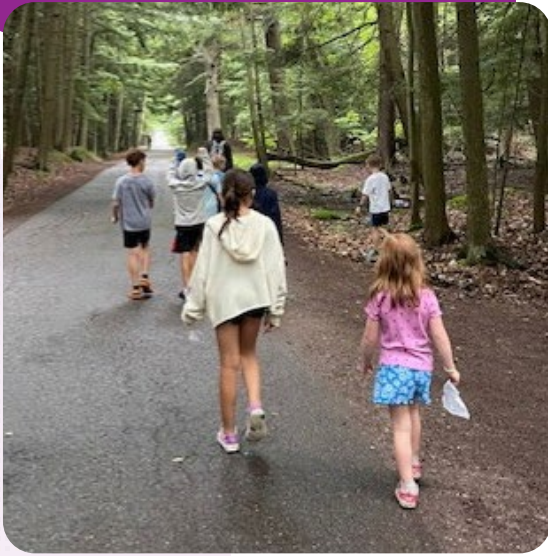
Day campers at Presque Isle.