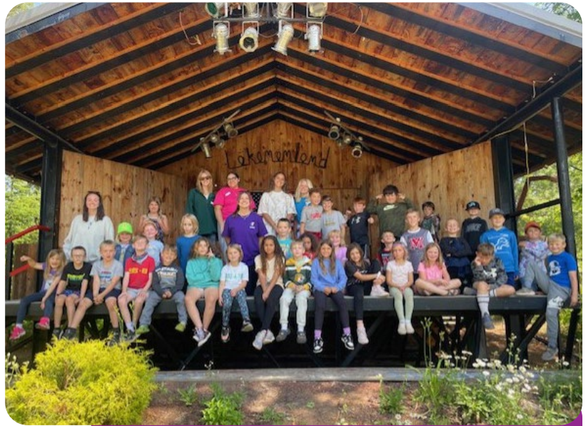
Day campers group photo at Lakemeland.