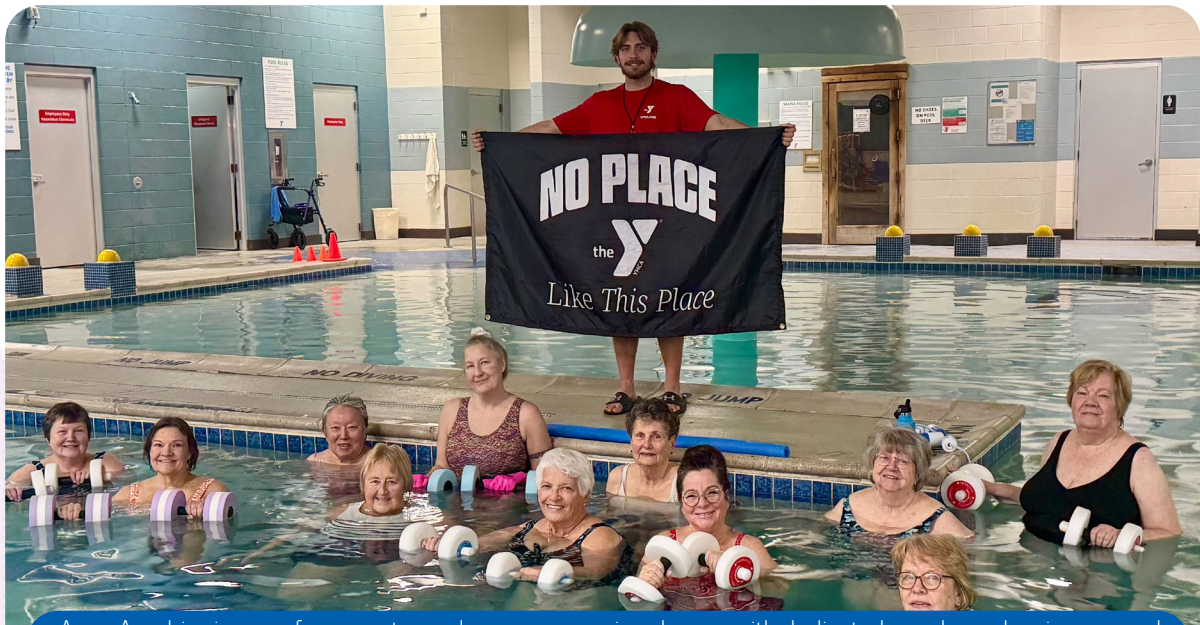
Aqua Aerobics is one of our most popular group exercise classes, with dedicated members showing up week after week. They know there's truly No Place Like This Place!

1,252 Group Exercise Land Classes Offered